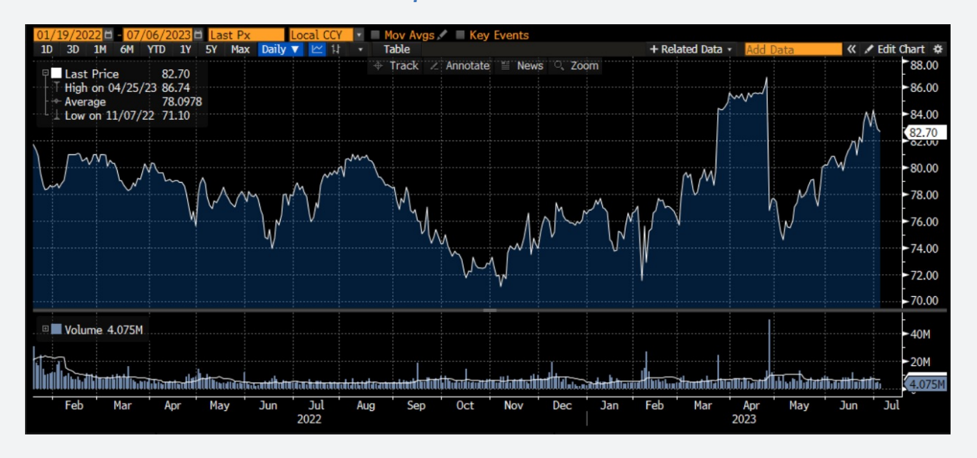
Exhibit 2: Activision Blizzard, Inc. Share Price Since Deal Announcement