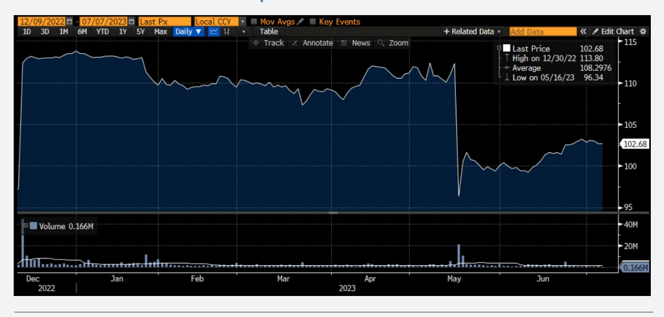
Exhibit 3: Horizon Therapeutics Share Price Since Deal Announcement

Early in 1Q 2023, the FTC issued what is known as a "second request" for US approval, before ultimately suing to block the merger from closing. This development caught market participants (including us) by surprise, given the lack of overlap between the merging entities. The FTC's case is based on unsubstantiated novel theories of harm and anticipated future behaviors that the acquiring company explicitly committed to avoid. Following this action by the FTC the gross spread widened out to >20% from <3%, reflecting a probability of deal closure of just 50%. While most arbitrage investors were forced to reduce exposure to manage their risk parameters, the fund was able to tactically increase exposure to the spread as it widened and offered a more compelling risk adjusted return. Given the fund's view that the probability of deal closure -- based on the merits of the case -- was closer to 80-90%, as compared to the 50% probability being priced into the stock post-news, we moved quickly to grow the position which ultimately generated an attractive return for the fund.