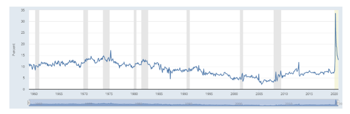
Exhibit 3: Multi-decade High Level of Savings

Source: U.S. Bureau of Economic Analysis I U.S. recessions are shaded; the most recent end date is undecided.